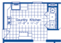
KITCHEN OPTION #1