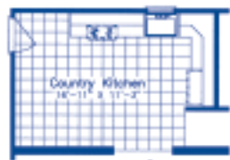
KITCHEN OPTION #2 WITH BASEMENT/SPLIT FOYER ONLY