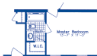
MASTER BATH OPTION

Independent Builders are not affiliated with North American Housing Corp.