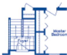
SPLIT FOYER OPTION