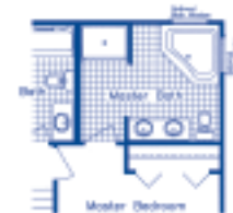
OPTIONAL MASTER BATH