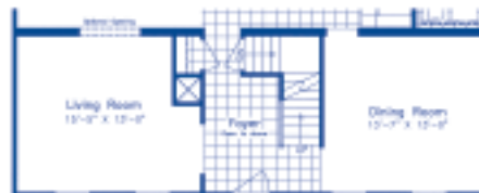
OPTIONAL L-STAR 1ST FLOOR